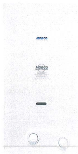
EUP 6 Litre & EUP 11 Litre